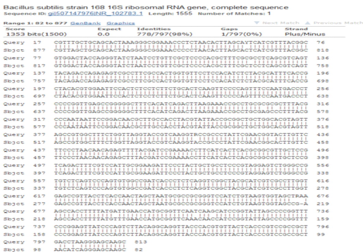
Figure 1: Bacillus subtilis strain 168 16S ribosomal RNA gene, complete sequence

Key: M = Molecular ladder, - Ve = negative control, BS = Bacillus subtilis